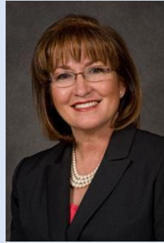
Honorable Teresa Jacobs Orange County Mayor

Project Website - http://www.ocfl.net/TrafficTransportation/PineHillsPedestrianBicycleSafetyStudy.aspx