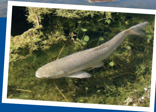
Grass Carp are a form of biological control for hydrilla.

6. Once the requisite percentage of property owners have approved establishing the MSBU, a public hearing is scheduled before the Board of County Commissioners (BCC) on the MSBU Resolution, and notice is mailed to all affected property owners.