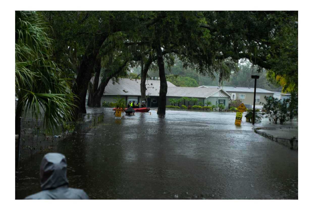
New CDBG-DR Allocation for Hurricane Milton

Orange County is currently working with our grant management consultant to develop and implement the Homeowner Housing Rehabilitation and Reconstruction program. This program aims to rehabilitate owner-occupied homes in Orange County that sustained damages during Hurricane Ian and still have remaining repair needs. The program will be open to eligible homeowners residing within Orange County and its municipalities. More information will be provided on the program website and in the newsletter as it becomes available.