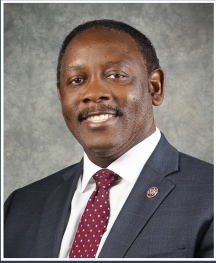
Orange County Mayor Jerry L. Demings